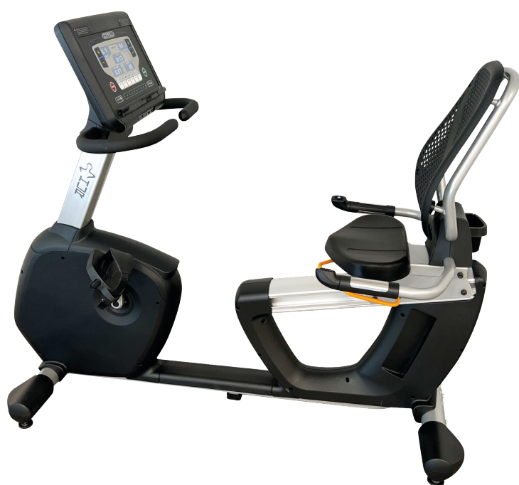
LCD display with a variety of program options